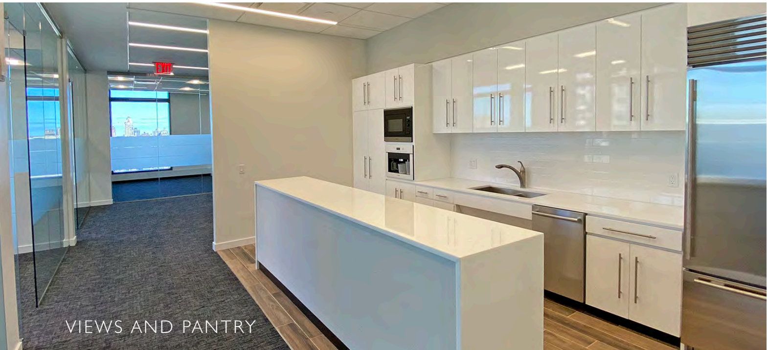
VIEWS AND PANTRY