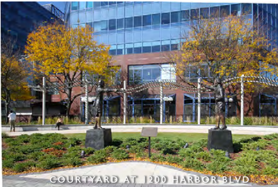
COURTYARD AT 1200 HARBOR BLVD

Third Floor: 34,104 SF Fourth Floor: 43,663 SF Eighth Floor: 34,420 SF & 13,956 SF Ninth Floor: 23,780 SF & 11,560 SF Tenth Floor: 23,270 SF & 4,742 SF Total: 189,495 SF