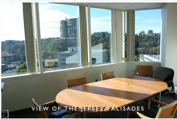
VIEW OF THE JERSEY PALISADES