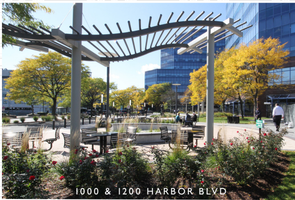
1000 & 1200 HARBOR BLVD