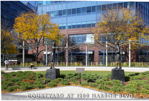
COURTYARD AT 1200 HARBOR BLVD