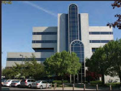
55 Challenger Road