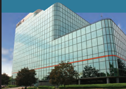
100 Challenger Road