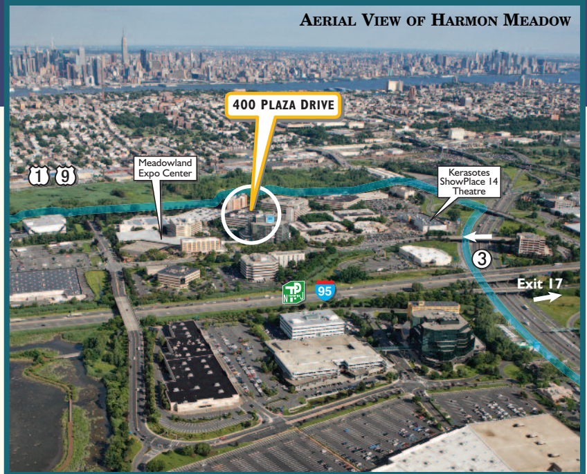
AERIAL VIEW OF HARMON MEADOW

Harmon Meadow offers the ideal work environment — combined with the perfect place to relax and socialize afterward. It's the best corporate lifestyle offered anywhere around.