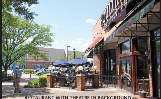
RESTAURANT WITH THEATRE IN BACKGROUND