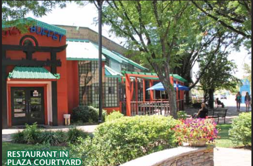
RESTAURANT IN PLAZA COURTYARD

Secaucus Junction Train Station: Connecting the entire metro region and beyond