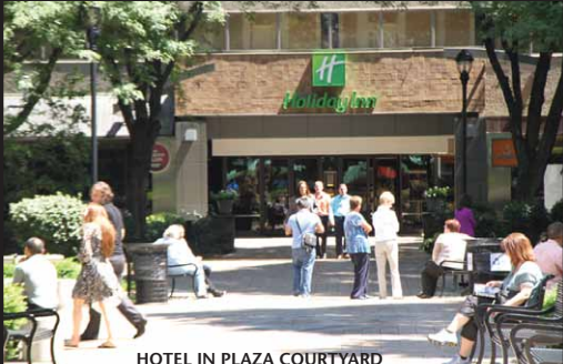
HOTEL IN PLAZA COURTYARD