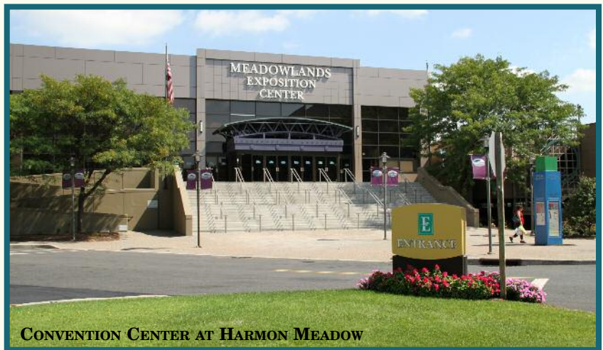
CONVENTION CENTER AT HARMON MEADOW