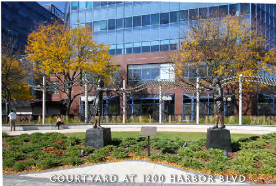
COURTYARD AT 1200 HARBOR BLVD